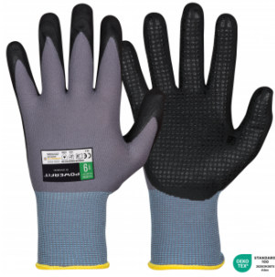
Assembly Gloves, Oeko-Tex® 100 Approved, patented nitrile foam coating with microdots